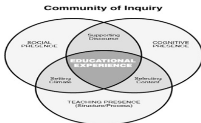
Figure 1. Community of Inquiry